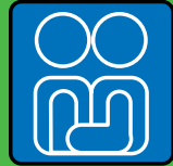
kissing & embracing