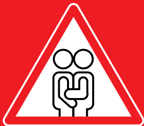
sex without condoms

RISK • DANGER • RISK • DANGER • RISK • DANGER • RISK • DANGER... ...in • blood • sperm • vaginal fluid • mother's milk