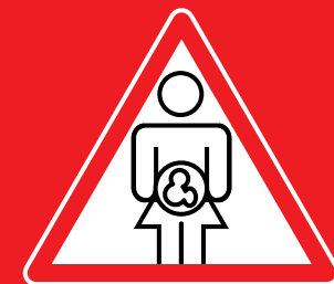
mother to child (at birth, breastfeeding)