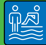
public swimming-pool & sauna