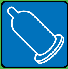
sex with condoms