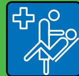
doctor & nursing

RISK • DANGER • RISK • DANGER • RISK • DANGER • RISK • DANGER... ...in • blood • sperm • vaginal fluid • mother's milk